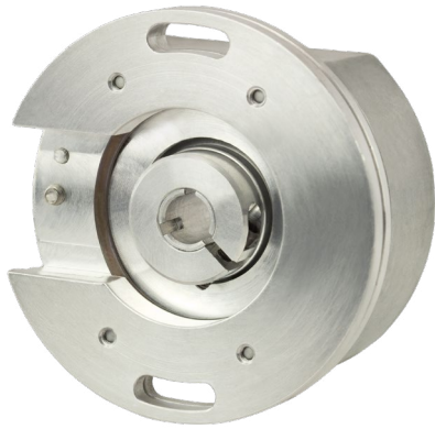
Ø2.1" Patent #6,608,300B2