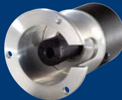
Model 755A NEMA