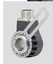
A Model 25T with an SJ Flex Mount Arm mounted on a motor shaft (inspection panel removed). In its harsh outdoor environment at a lumber mill, the dust-tight IP66 seal also protects the encoder from outdoor moisture.